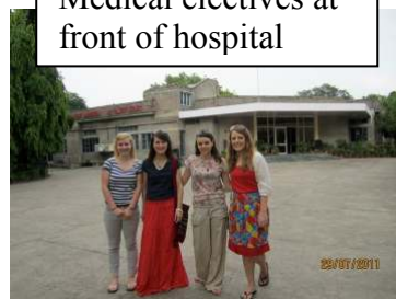
Medical electives at front of hospital